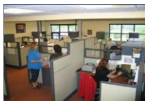
The National Cemetery Scheduling Office serves all national cemeteries, seven days a week, 362 days a year